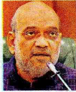
अमित शाह फाइल फोटो

नई दिल्ली, प्रेटर: केंद्रीय सहकारिता मंत्री अमित शाह मंगलवार को नाबार्ड और सहकारी समितियों के