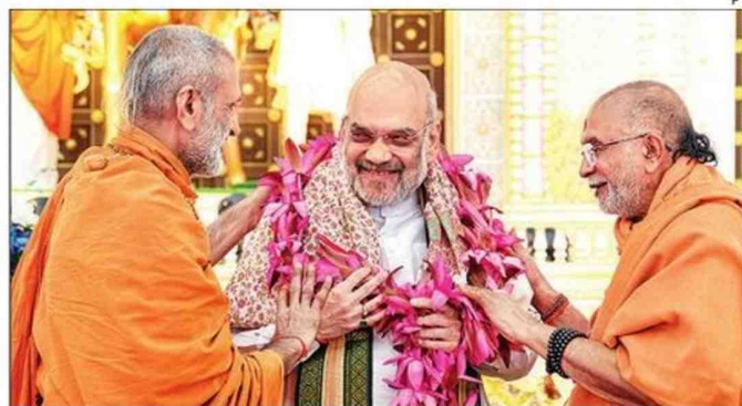
Union home minister Amit Shah attends Smriti Mahotsav at the Swaminarayan Gurukul Vishwavidya Pratishthanam in Ahmedabad on Saturday

"Cooperation among cooperatives is important for progress of cooperative sector. We have begun with a small pilot project by giving Kisan Credit Cards to each farmer in a couple of districts in Gujarat itself. Each farmer's account is being transferred to a cooperative bank. Milk payments are being transferred into their bank accounts. If this model is implemented across the country, it will bring about a