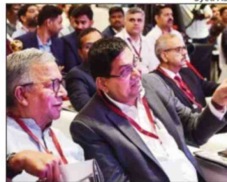
Attendees at the Microfinance Karnataka Summit on Tuesday

his team conducted with 16,000 customers of the industry across Karnataka showed that 89% of them prefer microfinance institutions to other lenders. As part of this exercise, the team found that 90% of the loans taken from micro-